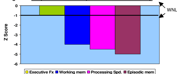
Figure 1. AD performance compared to Normative Group